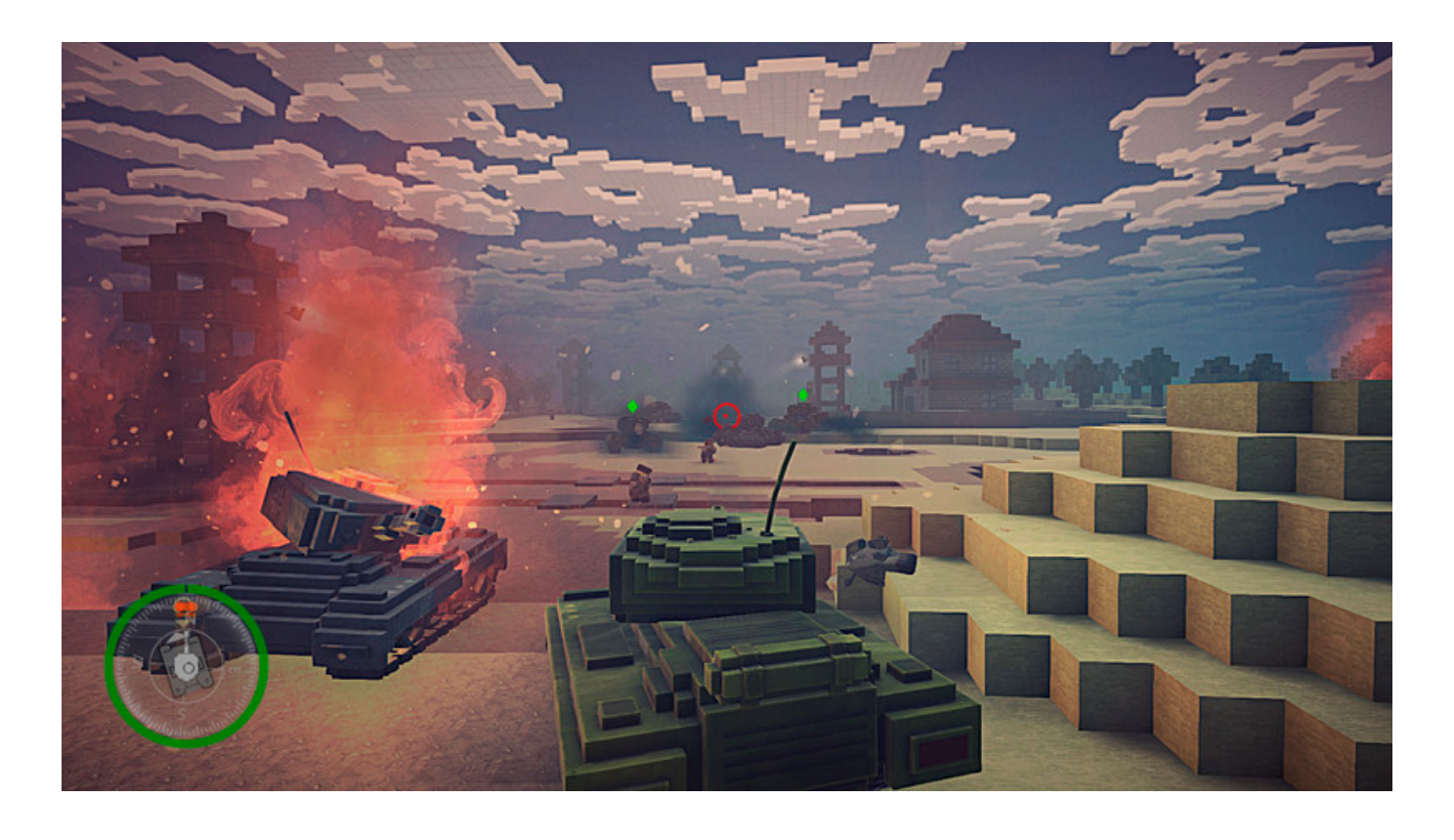
The Planet Of The Vicious Creatures Download Setup Compressed

Download ->->-> <a href="http://bit.ly/2NWzOJ5">http://bit.ly/2NWzOJ5</a>